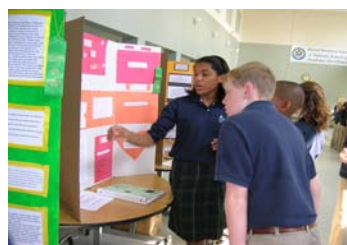
BSS Science Fair