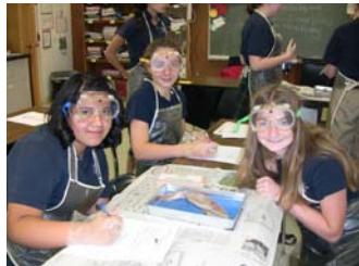
7th Graders Dissect a Squid