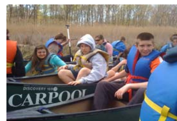
Chesapeake Bay Field Trip

Colonial Day! Every year the 4th graders at BSS spend a day immersed in their social studies curriculum. After learning from their textbooks, they 'live out' life as early immigrants. The students select a job and create a workspace. This year the occupations included silversmiths, blacksmiths, candle-makers, bakers, teachers, and militia members. Throughout the day, other grades visit the colonial village the 4th graders created. This interdisciplinary approach to hands-on learning helps the students engage in historical and critical thought.