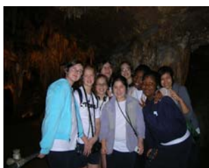
Luray Caverns Field Trip

Middle School Science Program! BSS boasts an inquiry-based science curriculum centered on analysis and investigation. In 6th grade students explore earth science throughout the year. A trip to Luray Caverns encourages the students to identify rocks and minerals in a real-life setting. The dissection of squid and frogs plays an exciting role in the 7th grade life science curriculum. These science labs help the students identify components of organisms in the environment. The 7th graders also spend several months conducting a controlled experiment for the annual science fair. This independent project allows them to utilize scientific reasoning to answer a question of their choice. Students in 8th grade explore elements of physical science including changes in matter and energy.